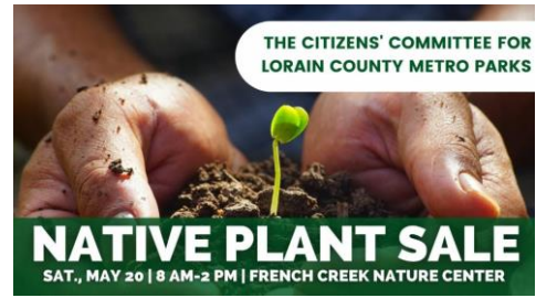
Citizens' Committee Native Plant Sale