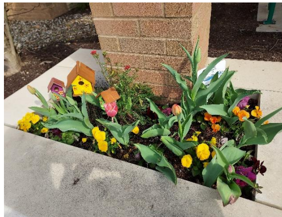
April 22nd Tulips have bloomed!

What Perennials would you like to see in the library planters for summer?